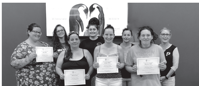
Parenting Class Graduates

26 students were given instruction on the subjects of Microsoft Word, Excel, Digital Photography, and Basic Computers.