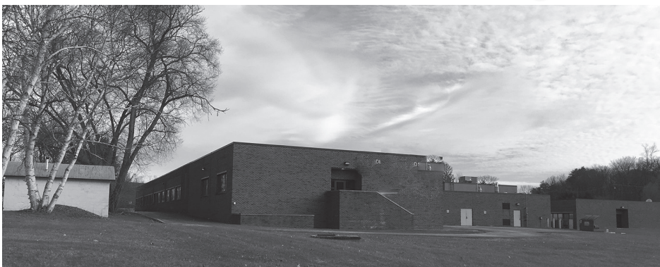
New Building Exterior