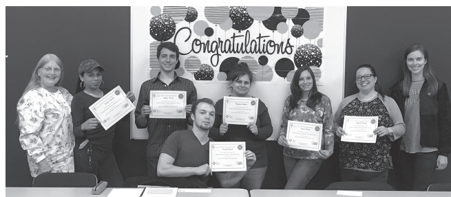
Faith and Finances Graduates