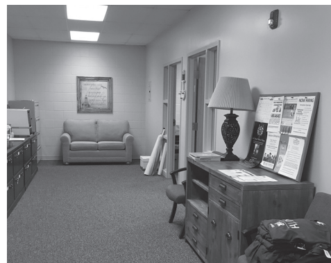
New Building Interior